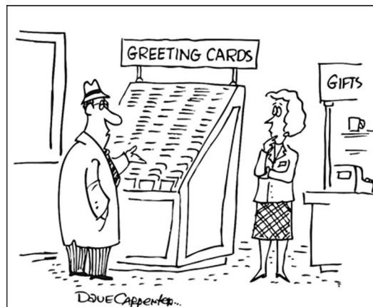
"Do you have one that says, 'Sorry my cell phone rang during your sermon?'"