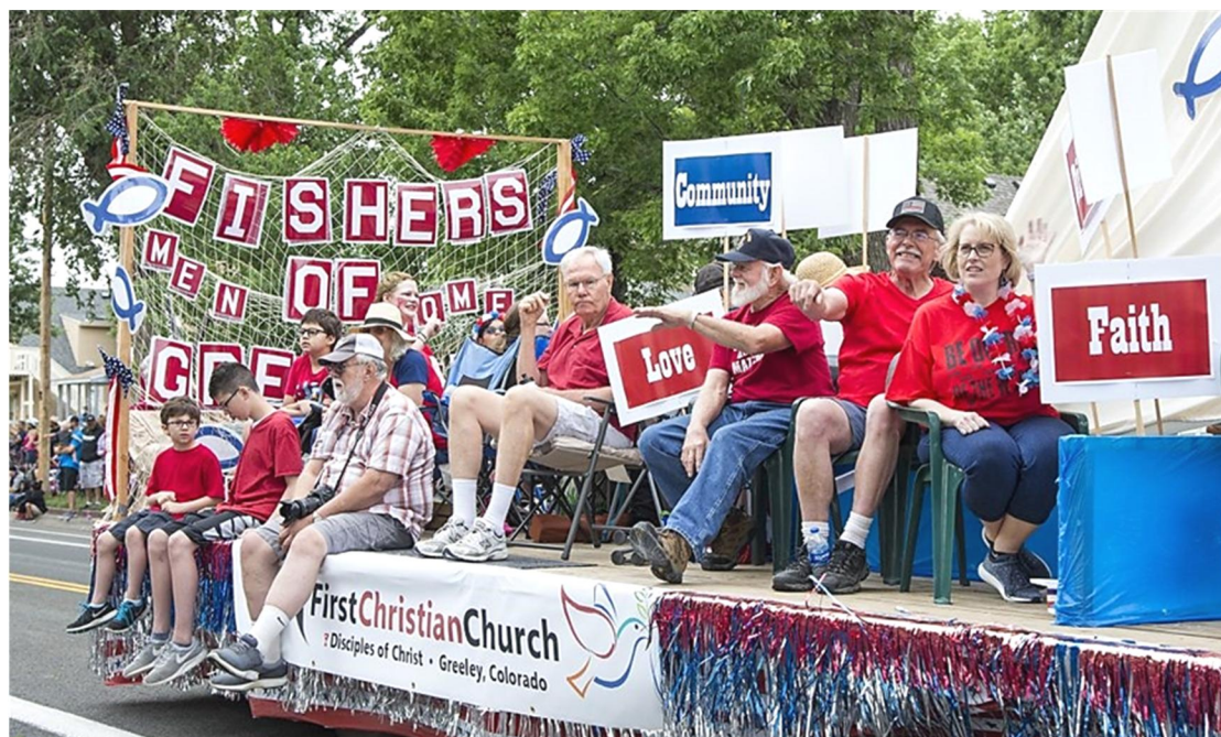
First Christian Church members built a float again this year for the Greeley Independence Stampede 4 th of July Parade. The float had a sailboat motif, and the theme was "Fishers of Greeley." Parade-goers responded well to the float and its broadcast of familiar old-time choruses while everyone enjoyed unseasonably cool weather.

I will see you in church. Remember, God loves you more than you could ever imagine and so do I!